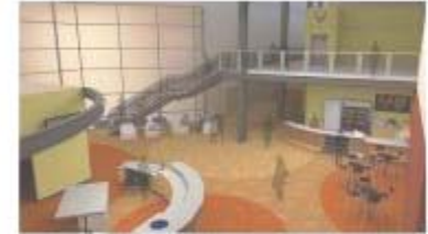
EXPANDED LOBBY SPACE AND JUICE BAR, VIEW FROM RUNNING TRACK