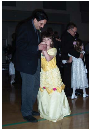
Everyone had a wonderful time at last year's Father Daughter Dance