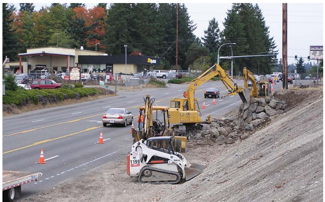
Construction is under way on Steilacoom Blvd. The project will add curbs, gutters, sidewalks, lighting and landscaping and is being paid for by the property owners through a local improvement district.

If you have any questions about any of these projects please contact the Public Works Department at 983-7795 or publicworks@cityoflakewood.us .