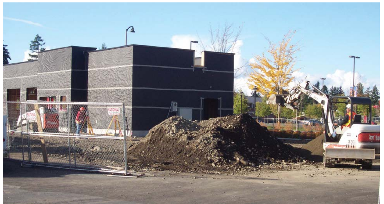
The new Starbucks under construction at the Towne Center should be open in December.

The task force will work on these projects over the course of the coming year. If you are interested in serving on the task force or finding out more about it, contact the Community Development Department at 512-2261.