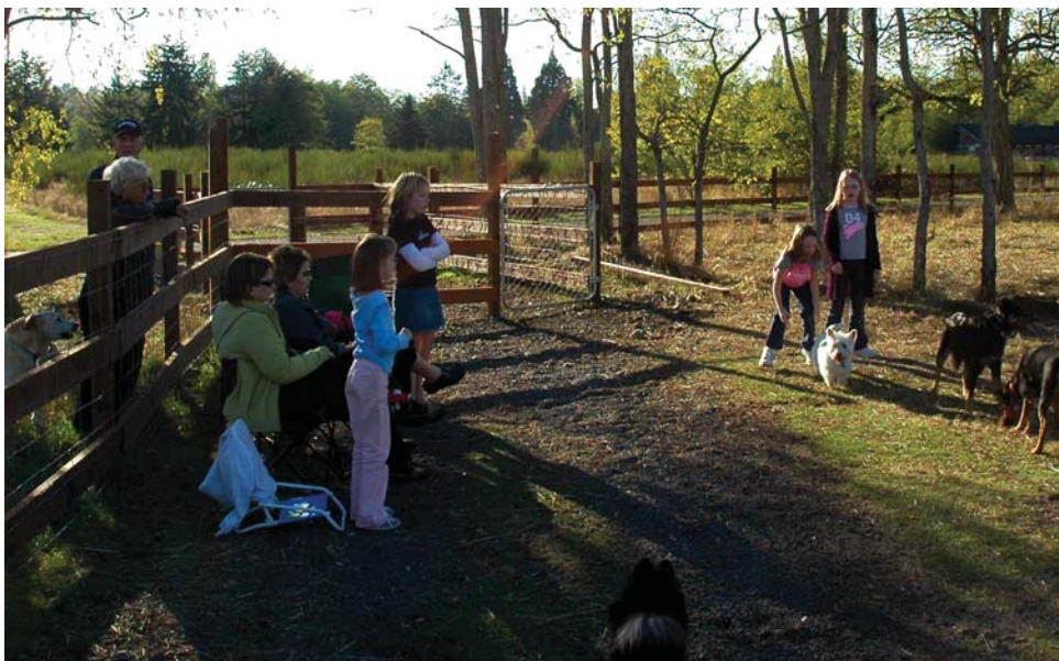
Dogs and people enjoy the new off leash area built by volunteers at Fort Steilacoom Park.

Volunteers representing Protect our Pets (POP) have worked hard this fall building a fence around a 22 acre off leash area at Fort Steilacoom Park. In 2003 and 2004 the City and County worked together to develop a master site plan for Fort Steilacoom Park. This plan designated an area in the southeast portion of the park as an off leash area. Because the City and County both require pets to be on leash in parks, the County stated that the area could not be used as an off leash area until a fence was built and a management plan was created for this area. POP was formed to establish, promote and maintain an off-leash area for both dog owners and their companions and enable them to socialize and exercise in a safe environment. The off leash area will be open during regular park hours (dawn to dusk). If you want to find out more about POP check out their website at www.parkdogs.com .