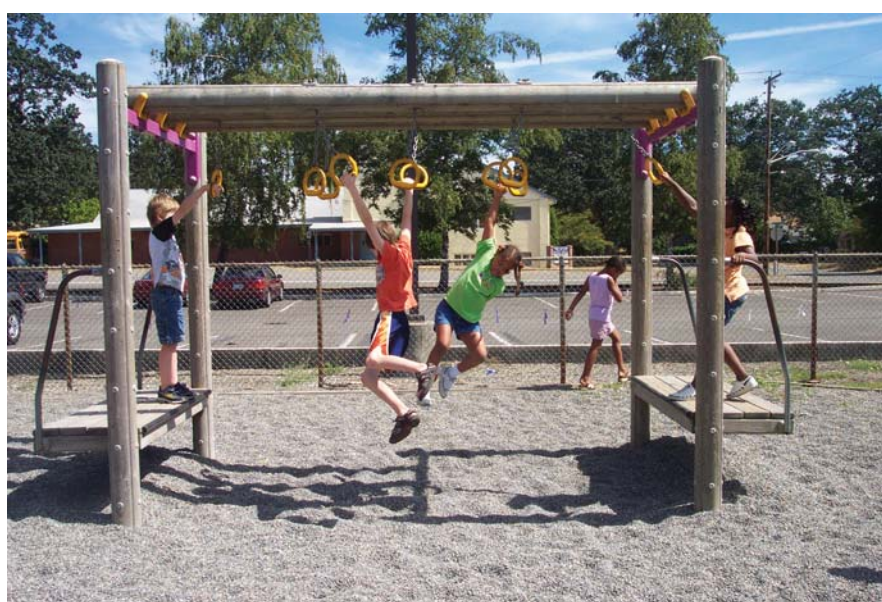
The Tillicum Summer Outreach Program is a great example of how Lakewood comes together for our youth. The Tillicum Summer Outreach program was supported by the City of Lakewood, Clover Park School District and the Boys & Girls Club.

To honor the 100 Best communities selected, America's Promise held a special event on November 2 in Washington D.C. The celebration and proceeds went toward helping the children impacted by Hurricane Katrina.