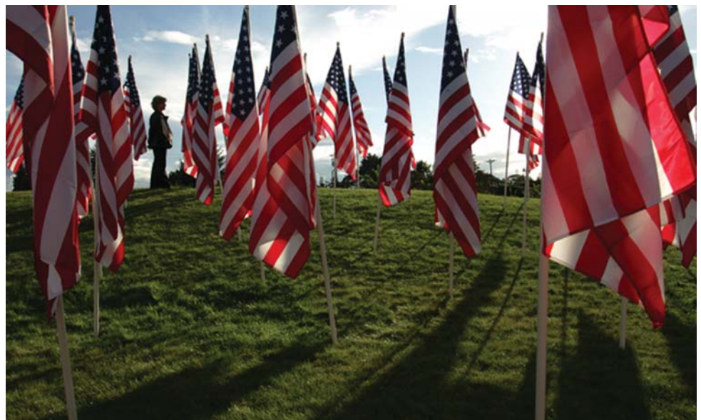
The Domestic Violence Healing Field was located next to City Hall October 3 - 5. It was a joint effort of the Business Masters Exchange Club and the Lakewood Partnership Against Domestic Violence.

For a free copy of the Crime Free Residential Catalog, contact the Police Department at 830-5000 or download a copy from the Police section of the City's website, www.cityoflakewood.us .