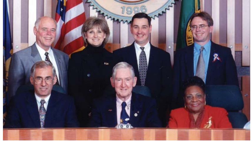
Lakewood City Council

The Lakewood City Council has been very encour-