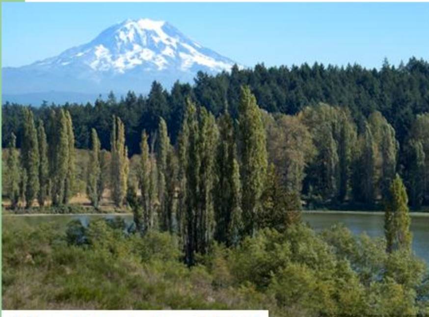
Waughop Lake at FSP